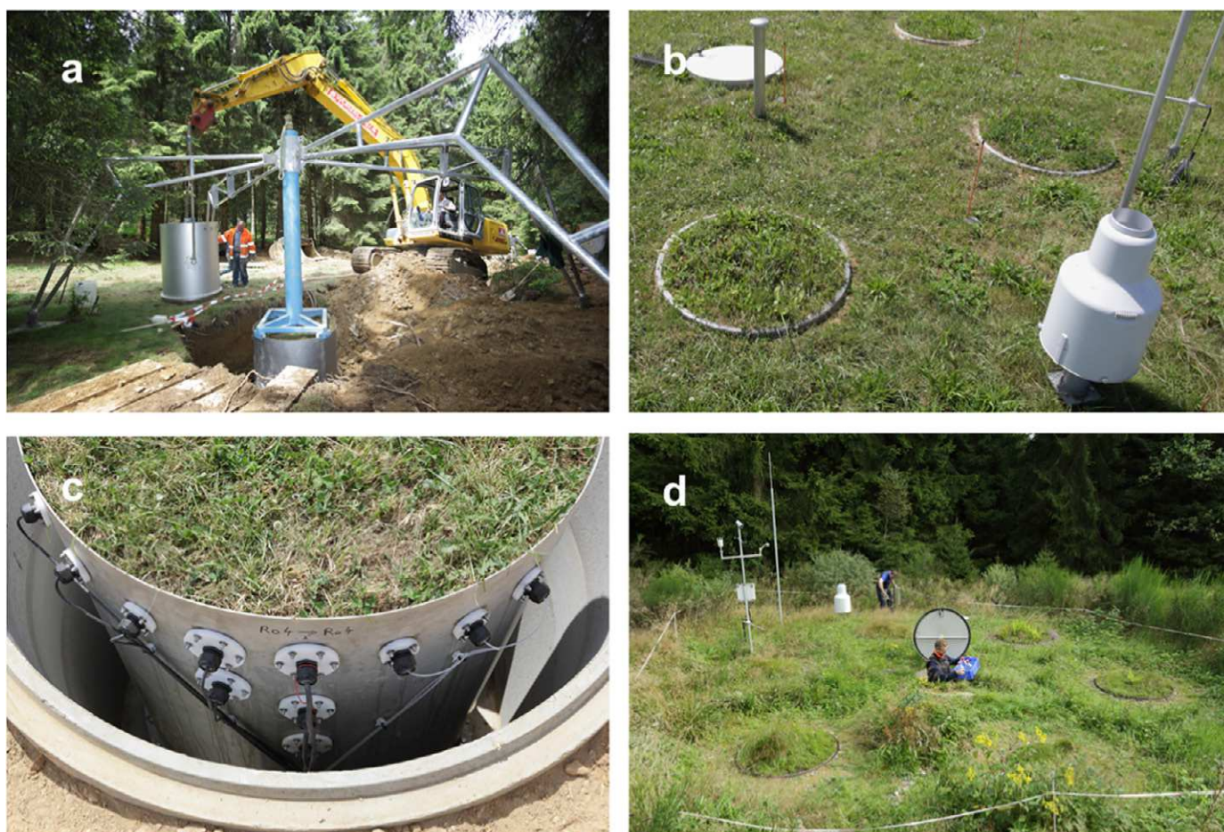
Fig. 2. (a) Coring of an undisturbed lysimeter core, (b) installed lysimeter, (c) instrumentation, and (d) view of a lysimeter setup with underground access.